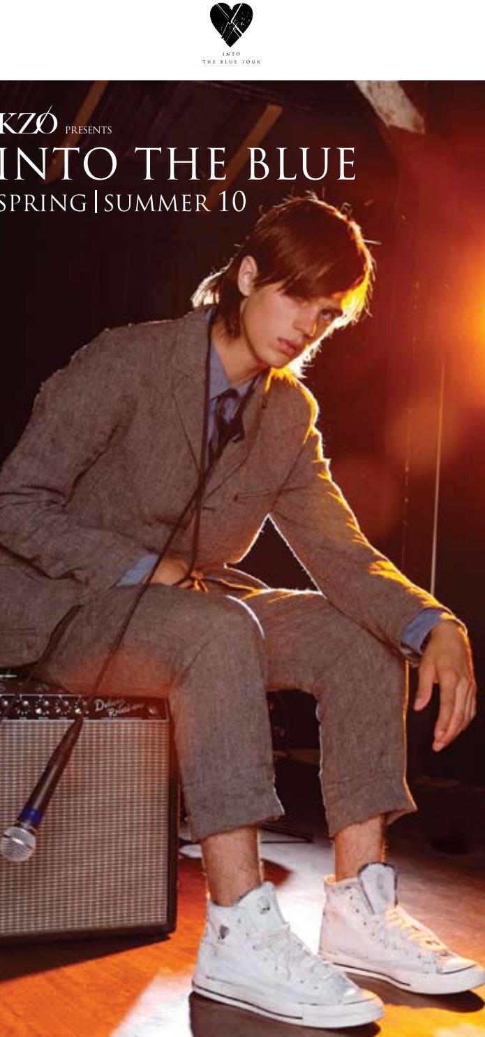
KZØ PRESENTS INTO THE BLUE SPRING | SUMMER 10